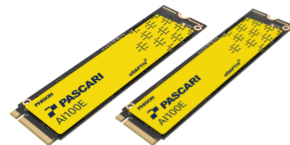
AI100E M.2 SSD

MaiStorage is a member of Phison group, the world's leading independent supplier of NAND controller ICs and NAND storage solutions for enterprise, consumer, and embedded markets. By leveraging Phison's proven technology, extensive expertise, and vast experiences, MaiStorage will deliver premier storage solutions tailored to diverse market needs.